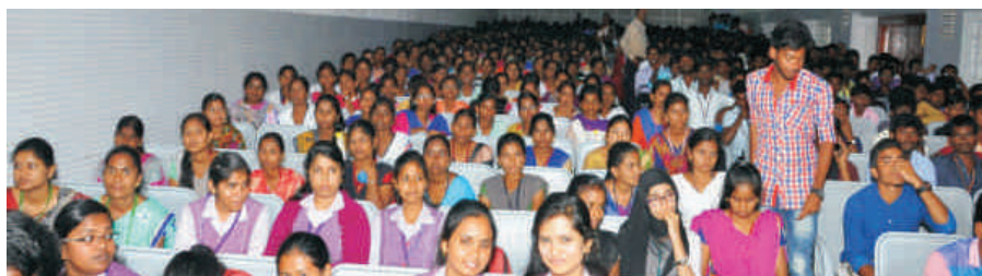
Fusion-2K18 Technical Symposium (14-02-2018)