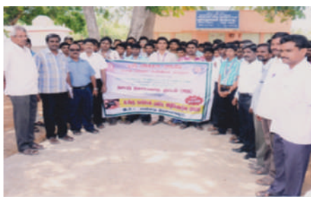
Dengue Awareness Program in Mampatty and nearby villages