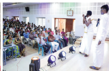
SMOC- An Intra College Cultural Meet 2018