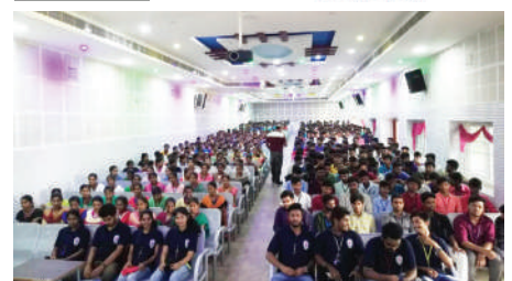
Soft Skill Training conducted to the Students