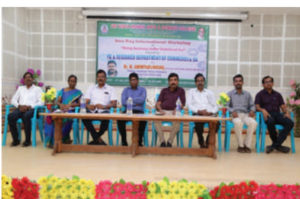
A one day International Workshop on Doing Business in Globalised Era on 7.2.2019