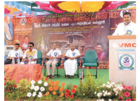
தமிழாய்வுத்துறை சார்பில் நடைபெற்ற இலக்கியமன்ற விழா