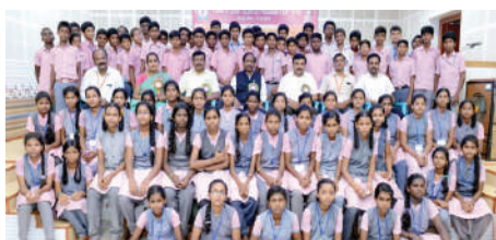
Young Student Scientist's Programme 2019, organized by our College with Financial Support of the TNSCST, Government of Tamil Nadu, Chennai from 03rd to 17th May 2019