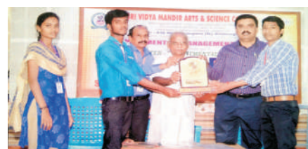
One day State Level Inter-College Meet SEASAW – 2017