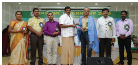
INSPIRE Internship Science Camp 2019, organized with Financial Support of DST, Government of India, New Delhi from 18th to 22nd October 2019