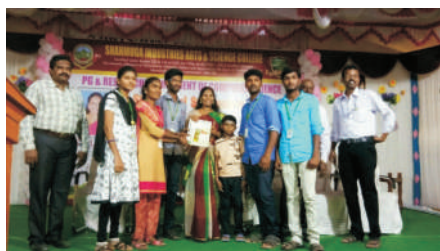
Students participated and won prize in Inter Collegiate Meet '18 conducted by Shanmuga Industries Arts and Science College