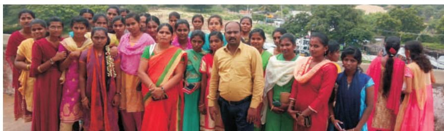
UG and PG students Educational Tour to Rameshwaram