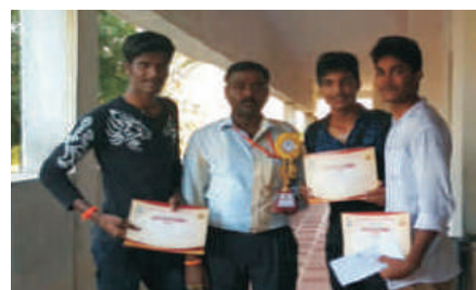
UG students participated in the Sri Vidya Mandir Meets of challenge on 8 th September 2019.