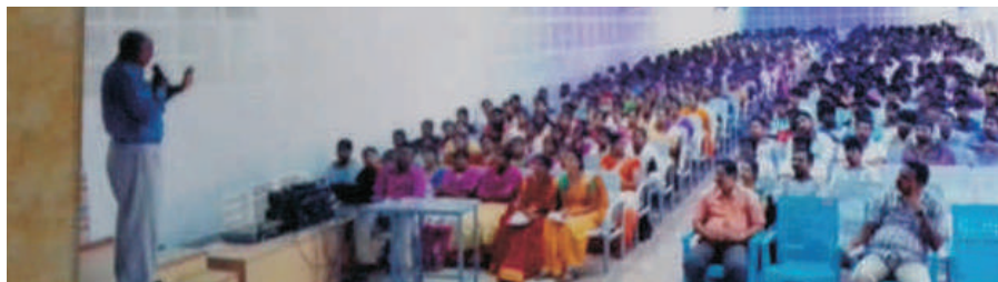
Our department conduct on one day international workshop on New photo catalytic materials for Environment, Energy & Sustainable Development (IWPEES-2019) on 26 th February 2019.