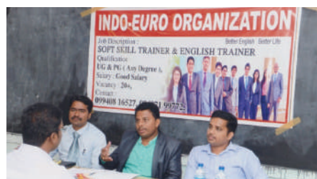
Face to face interaction conducted by Indo-Euro Organization during mega job fair.