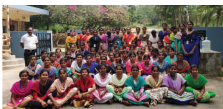
Department Students Institutional Visit to Vainu Bappu Astronomical Observatory at Kavalur during December 2018