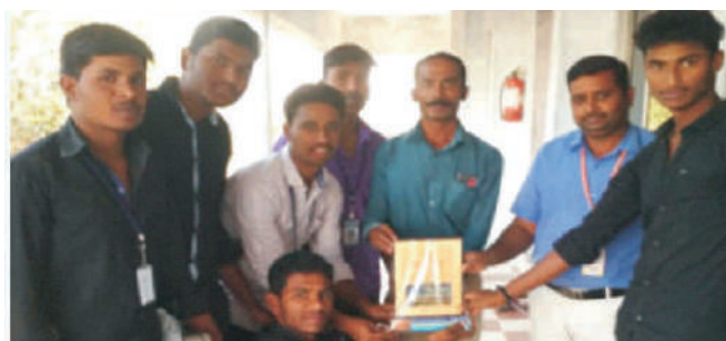
Our students participated TAMILNADU STATE SENIOR (MEN & WOMEN ) WRESTLING CHAPIONSHIP (2018-19) ON 25 & 26 AUGUST at TEXVALLEY, Gangapuram, Chithote, Erode