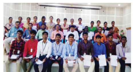
Selected students with offer letter through Placement Cell.