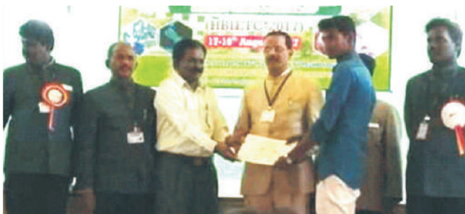
Our Department student attended International Conference at VEERIYA VANDHAIYAR MEMORIAL SRIPUSHPAM COLLEGE POONDI on 17 -18 August 2017