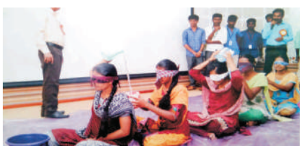
State Level inter College Meet SEASAW – 2018