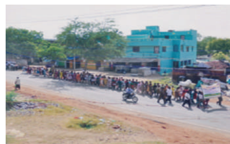
Road Safety awareness rally in Uthangarai town.