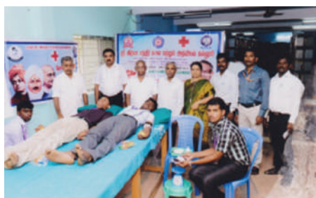
On behalf of Founder's birthday celebration NSS Organised Blood Donation Camp in our College premises

awareness program, Swachh Bharat Internship camp, observance of former President Dr. APJ Abdul Kalam's memorial day, rally on wearing helmet, free eye vision screening camps, heart-fullness meditation program, awareness for women safety, mass cleaning camps, blood donation camps, contribution to HIV/AIDS affected children's, life skill development program, special camps (7 days) at nearby villages, national voters day awareness rally, Independence Day celebration, Republic Day celebration, World Forest Day celebration, International Youth Day celebration, National Voters Day celebration, Pongal festival celebration, Teachers Day celebration, International Women Day celebration, etc.