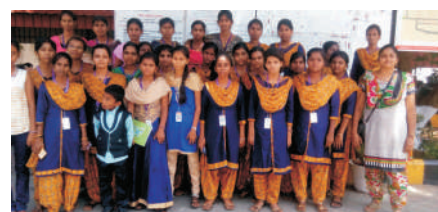
Students of BBA & BBA (CA) visited Hindustan coca-cola beverage private limited, Chennai