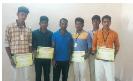
UG students participated in the Inter College Kabaddi Competition.