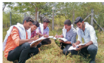
PG students collecting medicinal plants in the college campus.