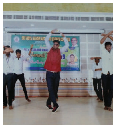
Our Department Students Cultural Performance during the Farewell Function 2019