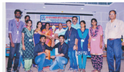
Students Receiving Prize in Fusion-2K18 Technical Symposium (14-02-2018)