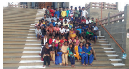
PG department of chemistry educational tour in Kanyakumari on December 2018