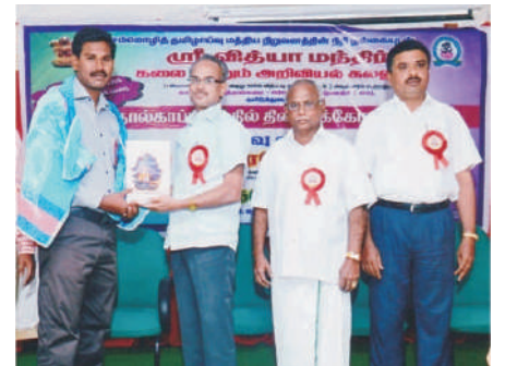
தமிழாய்வுத்துறையில் நடைபெற்ற செம்மொழிப் பயிலரங்கில் சிறந்த ஆய்வாளருக்காக விருது பெறுதல்