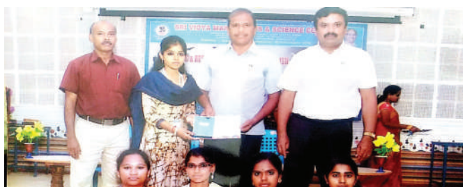
Students receiving prize in the IDEAL FEST' 2019 held on 09.02.2019 at SVM College.