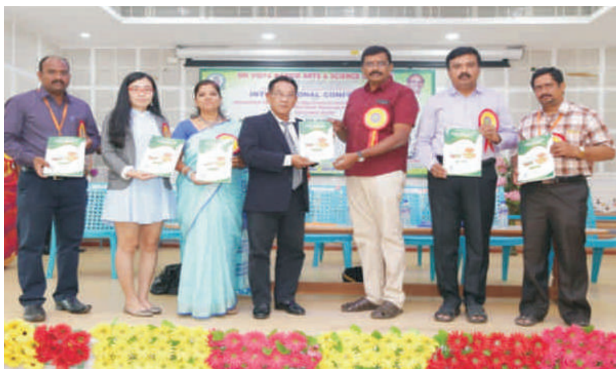
Release of conference proceedings during one day International conference on 20 th December 2018.