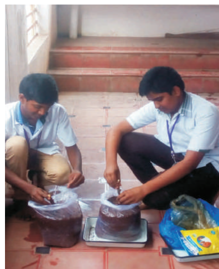
III B.Sc., Students – Prepared a Mushroom cultivation bags