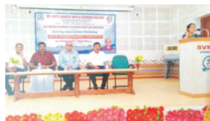
One Day International Workshop on Data Mining and Warehousing Concepts