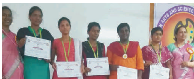
Students winning prize in Literary Competition from Adiyaman college of Arts & Science Uthangarai