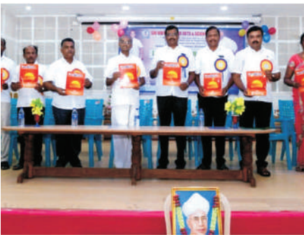
மாணவர்களின் படைப்புகள் - மகிழ்ச்சி இதழ் வெளியீடு