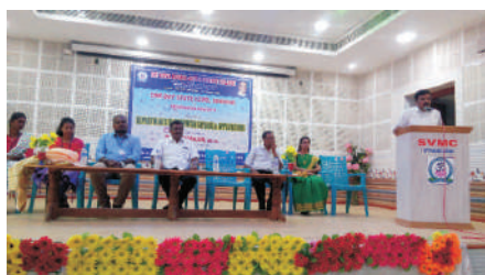
One Day State Level Seminar on Networking th Concepts 8 Feb 2019